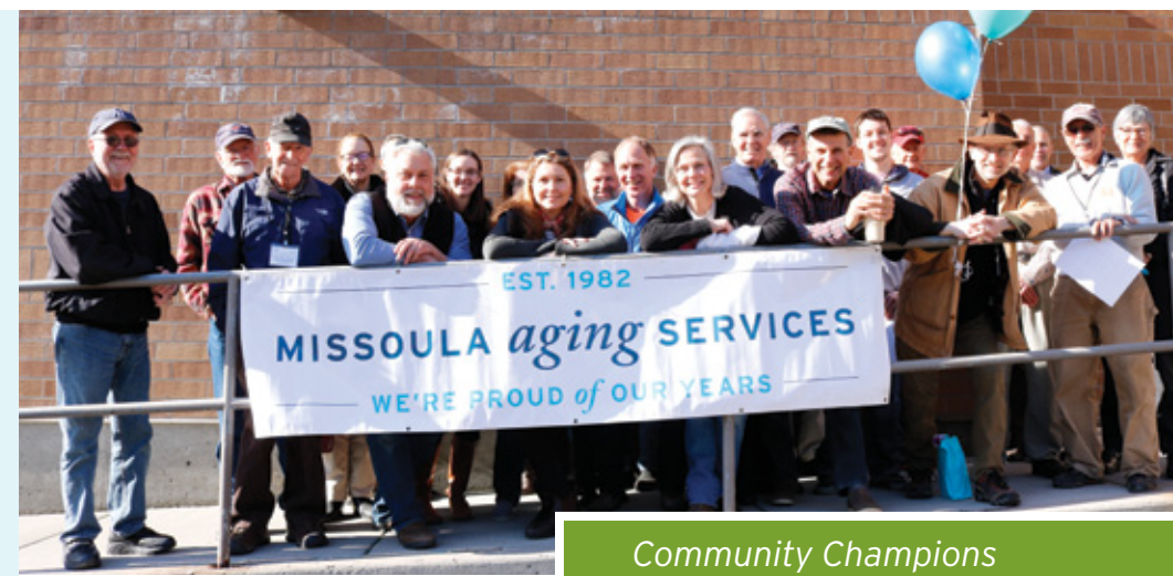
Community Champions gathered to help deliver meals.